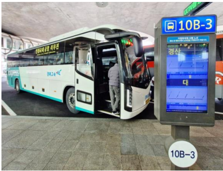
Terminal 1 bus taking location: (Exit from Gate 10) and wait at 10B-3.